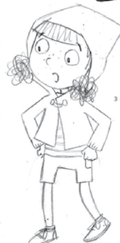
3 short shorts!