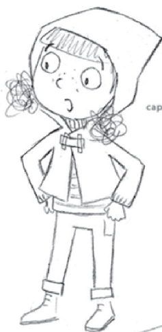
cape and jeans