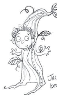
Jack as a beanstalk