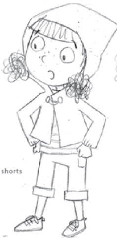
1 longer length shorts