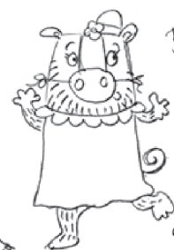
Bears in pink piggy costumes